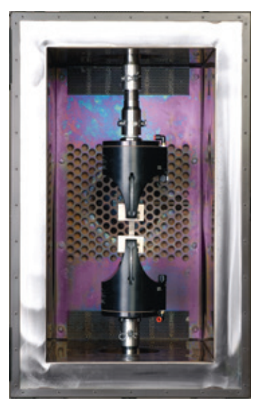
Load extension kit and pneumatic grips in an environmental chamber